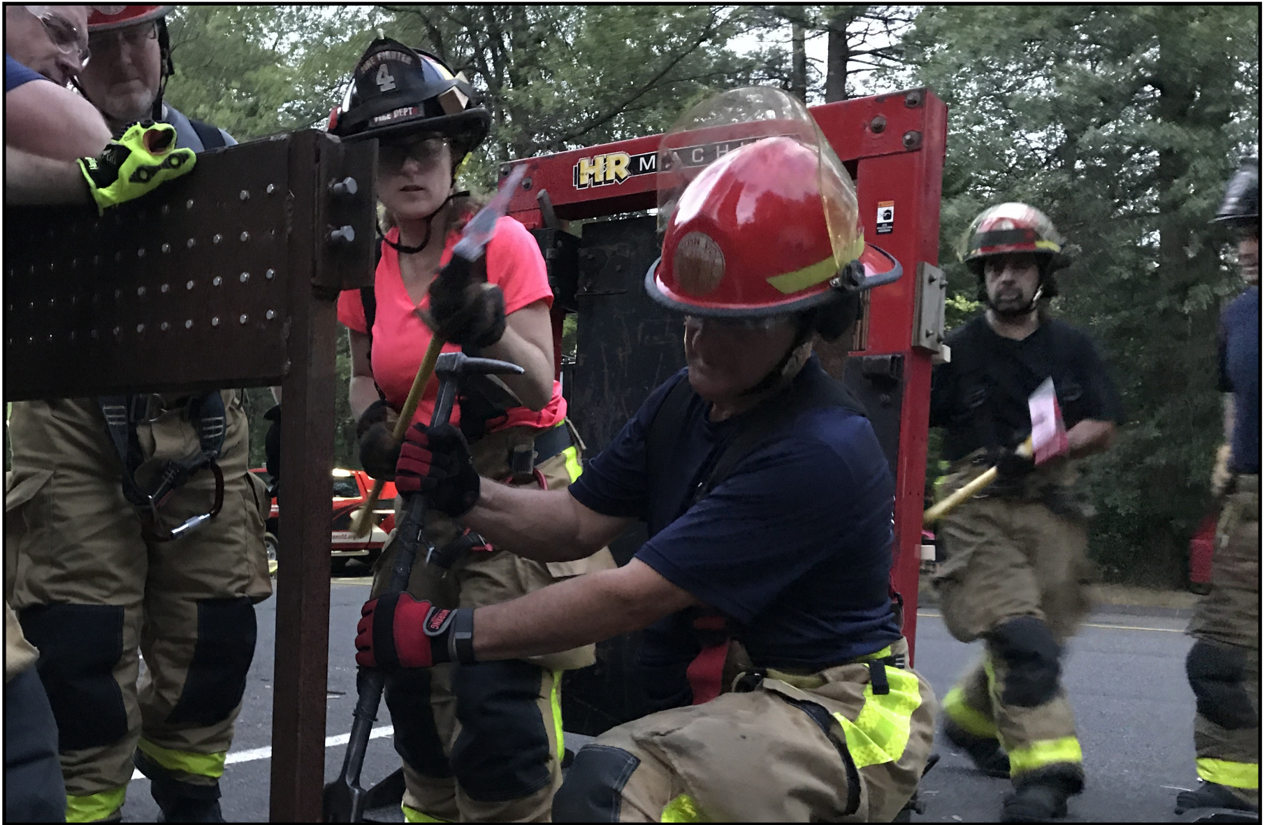
Members of the AVFD train weekly to prepare for all types of emergency situations. The Department is proud to partner with Monroe, Connecticut-based Flash Fire Industries, the Northeast's first and only mobile fire fighter training trailer, for such exercises as forcible entry, roof ventilation, metal saw operations, window training, and much more.