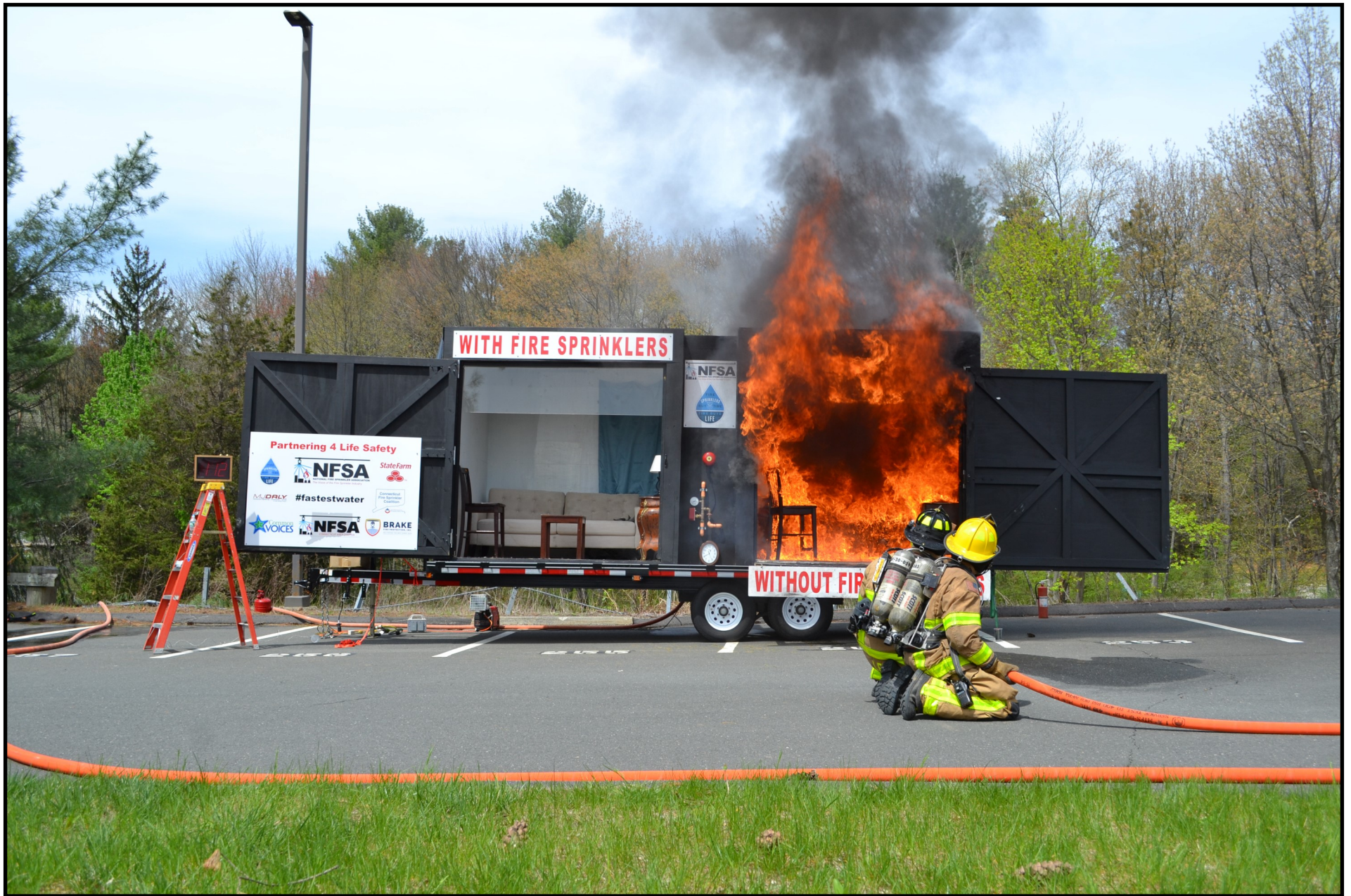
Avon Volunteer Fire Department firefighters prepare to extinguish the flames after a fire sprinkler demonstration at the AVFD's Emergency Services Day in May 2018. These men began with the AVFD as Explorers, students ranging in age from 14 to 21 years old who, just like regular members of the Department, train weekly learning how to provide support to AVFD personnel as well as explore a future career in firefighting. Explorers assist with fire safety education in Avon's elementary schools during Fire Prevention Week every October.