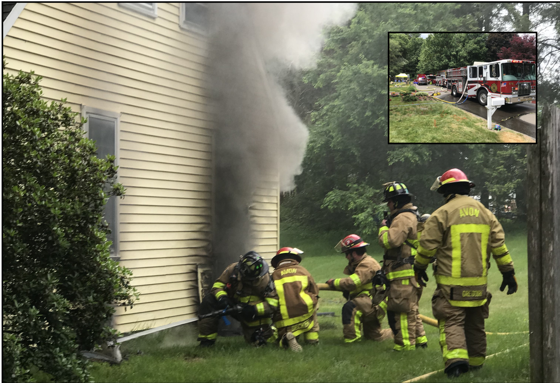
Volunteer firefighters douse remnants of a structure fire in June 2018. First fire personnel on scene confirmed smoke and flames coming from the single family residence with the home's occupants having evacuated. Thanks to mutual aid assistance from our neighbors at Simsbury Volunteer Fire Company, New Hartford Volunteer Fire Department, and Tunxis Hose Company, crews quickly extinguished the blaze. During the incident, Burlington Volunteer Fire Department provided station coverage and Farmington Fire Department responded to an odor of gas call in town.