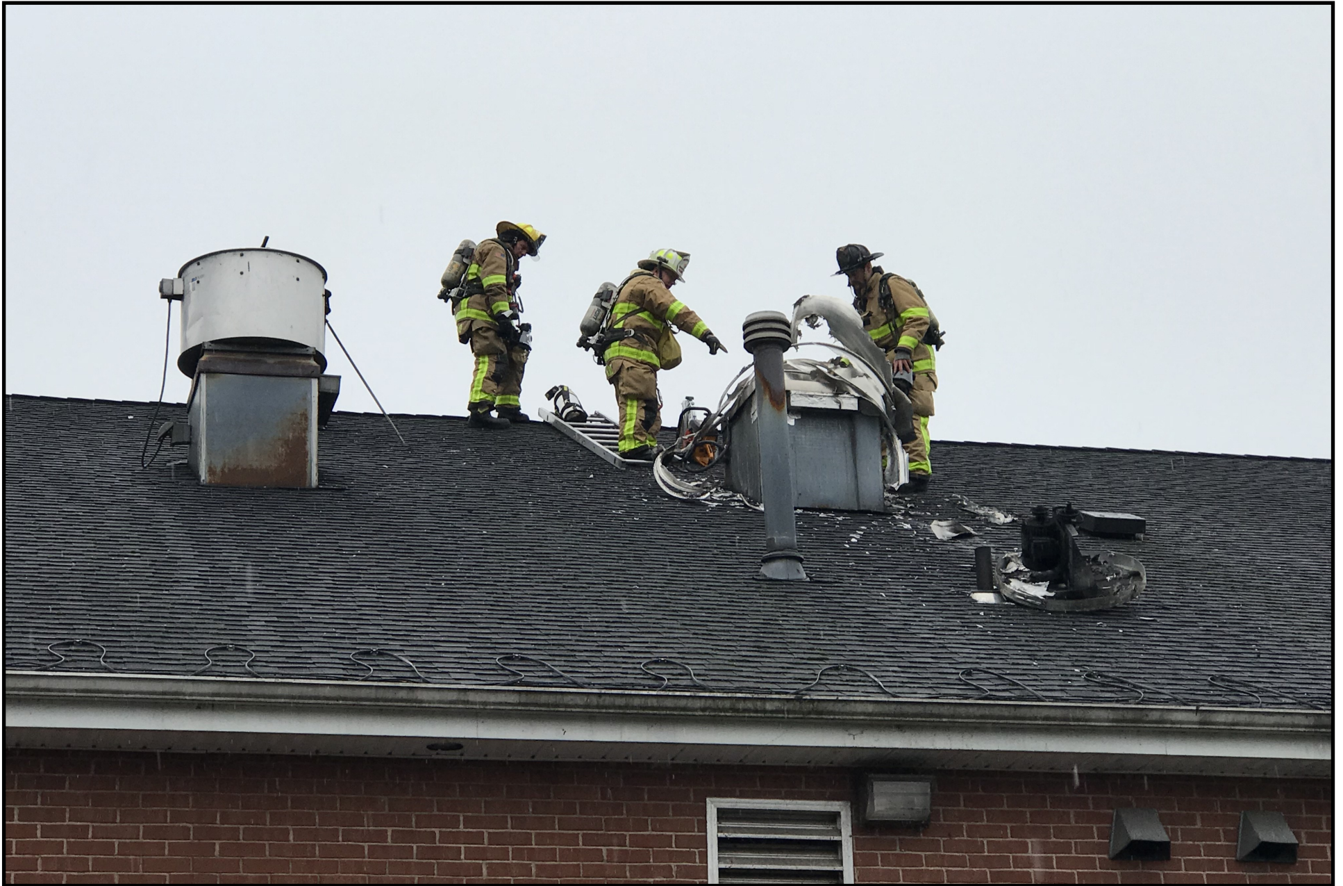
Avon Volunteer Fire Department personnel inspect duct work on the roof of a commercial building following a fire.