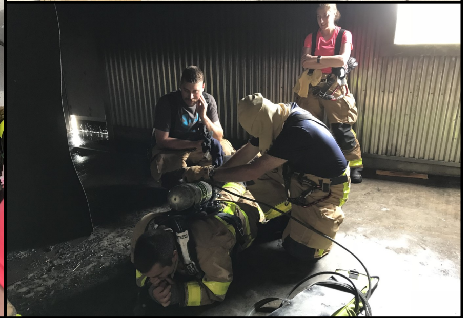
Members of the AVFD spent a day evaluating and testing new self-contained breathing apparatus (SCBA) at the Live Fire Training Facility in Farmington. The team explored the various features of two different manufacturers' of SCBA in order to make the most informed recommendation for the replacement of the AVFD's current life-saving SCBA. A $277,286 grant from the Federal Emergency Management Agency (FEMA) and the Department of Homeland Security subsidized the AVFD's recent purchase of new equipment.